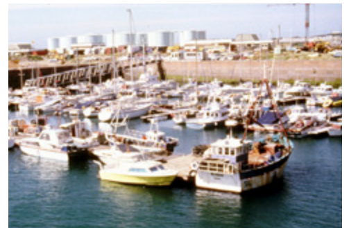
La Collette (Jersey Island)