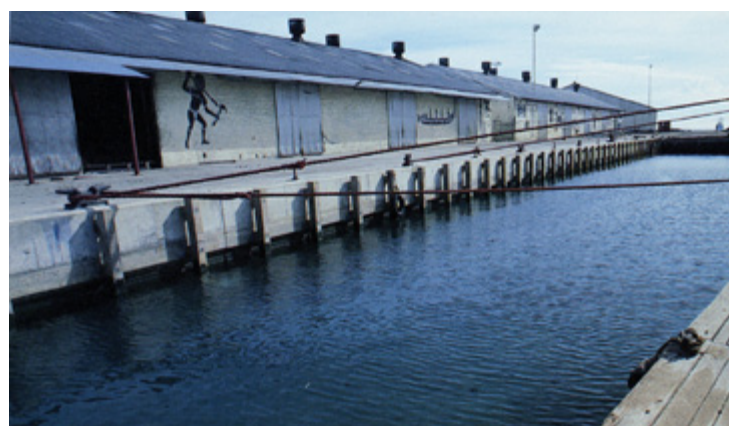
Honiara Copra Wharf (Solomon Islands)