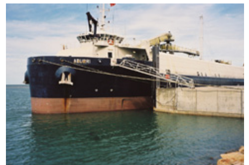
Bing Bong wharf (Australia)