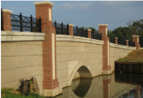
Beacon Island, Galveston, Texas (USA)