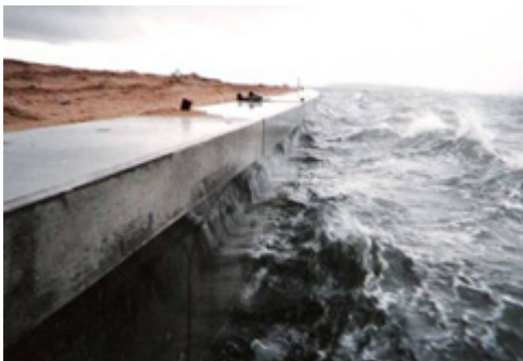
Sydney Airport (Australia)