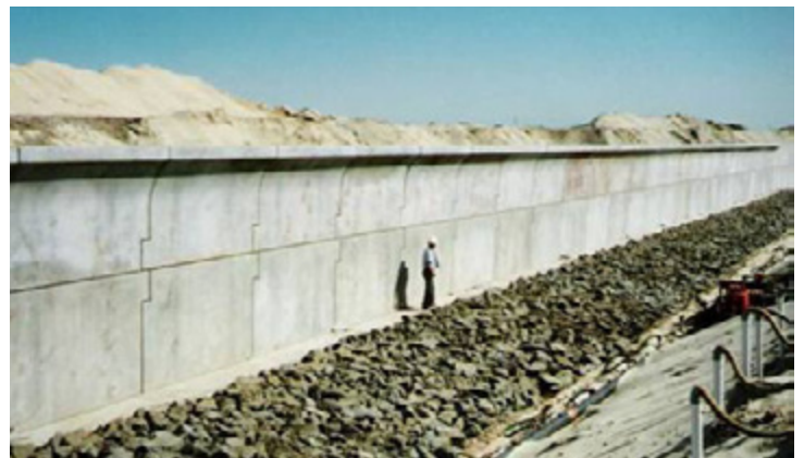
Sydney Airport (Australia)