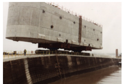
Severn River estuary (United Kingdom)