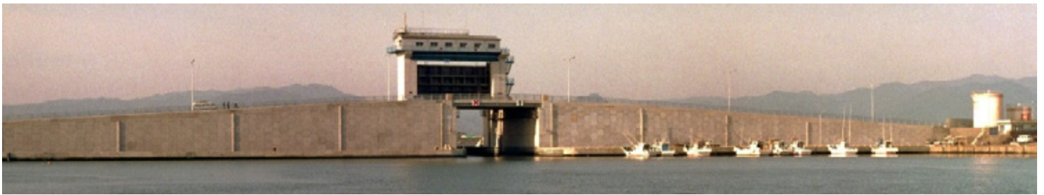
Miyazaki Port (Japan)