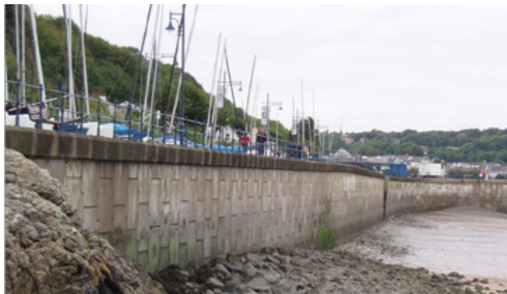
Swansea (United Kingdom)