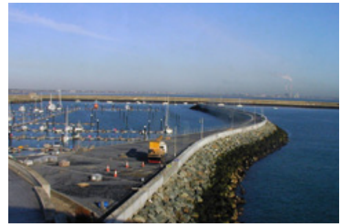
Dun Laoghaire (Ireland)

The GeoMega® system can be combined with a waterproofing membrane on the back face of the panels (patent pending). This allows the use of Reinforced Earth® solution for structures which need to be watertight such as dry docks or protection levees against cyclonic storms or sea water surges.