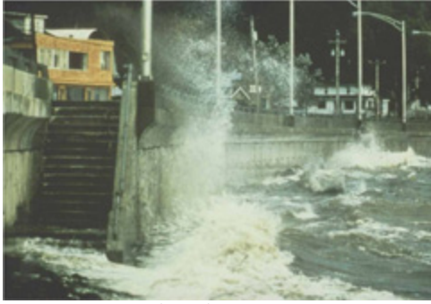
Gaspé peninsula, Quebec (Canada)

Drawing on their global expertise and track record, Reinforced Earth entities worldwide bring tailor-made solutions and provide support at all stages of the projects, fulfilling the demanding requirements of marine applications.