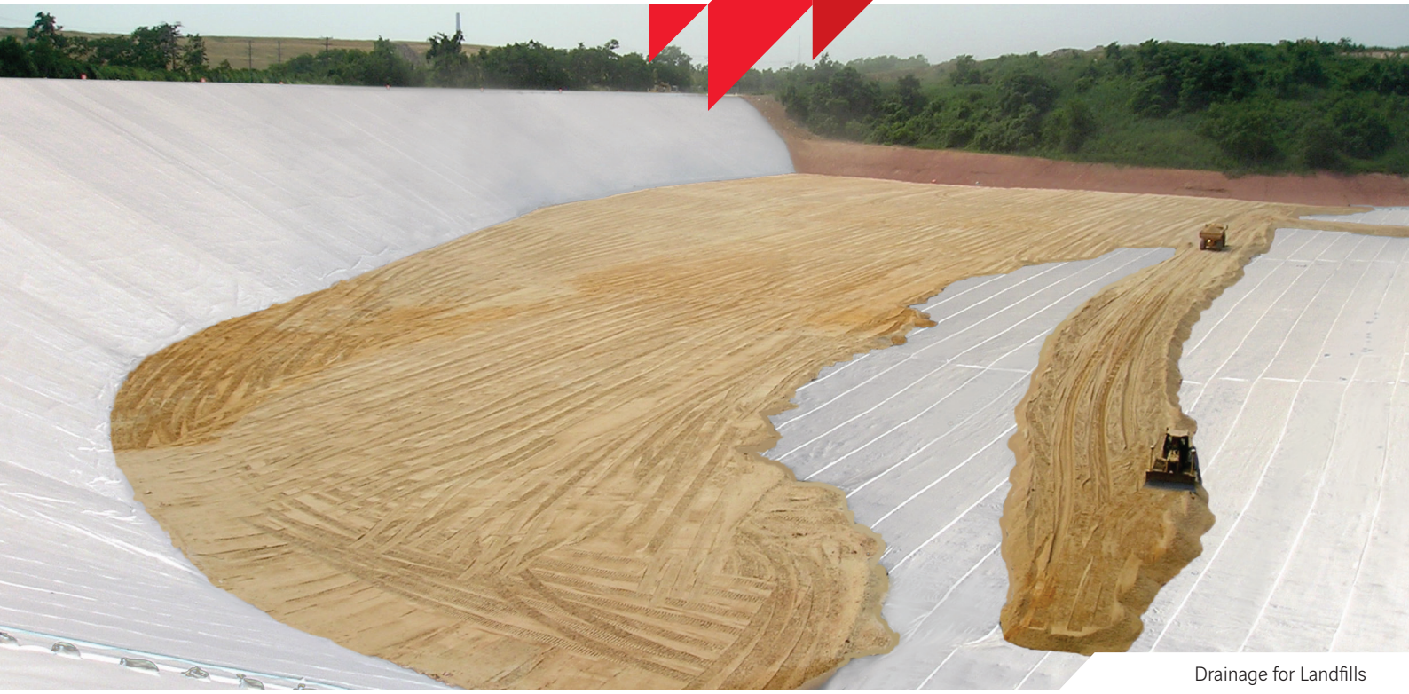
Drainage for Landfills