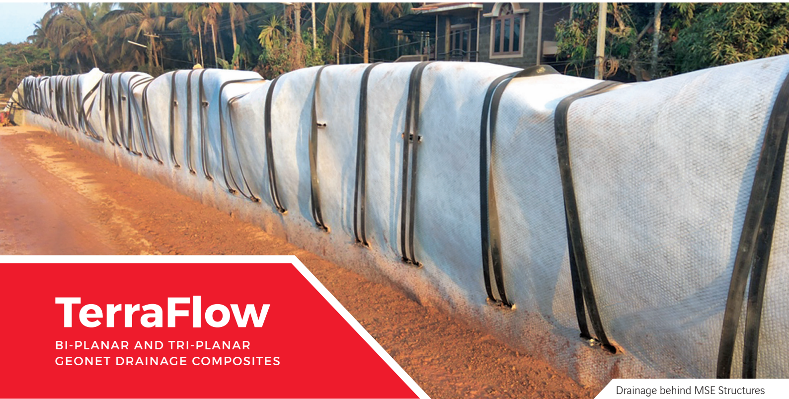
Drainage behind MSE Structures